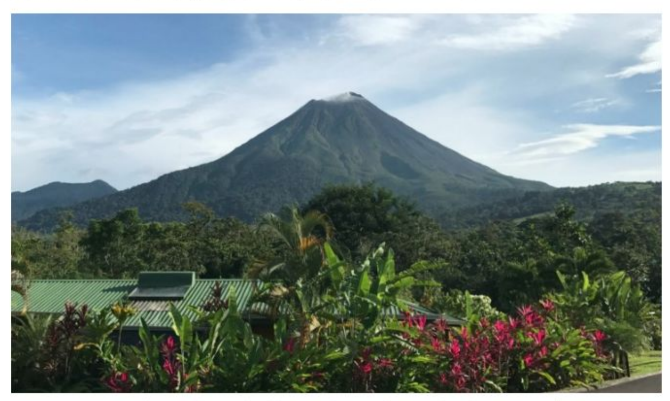
One of our TravelingMoms loved this trip with Disney Adventures!

Costa Rica – Volcanoes, Jungle Tours, Zip Lines And More!