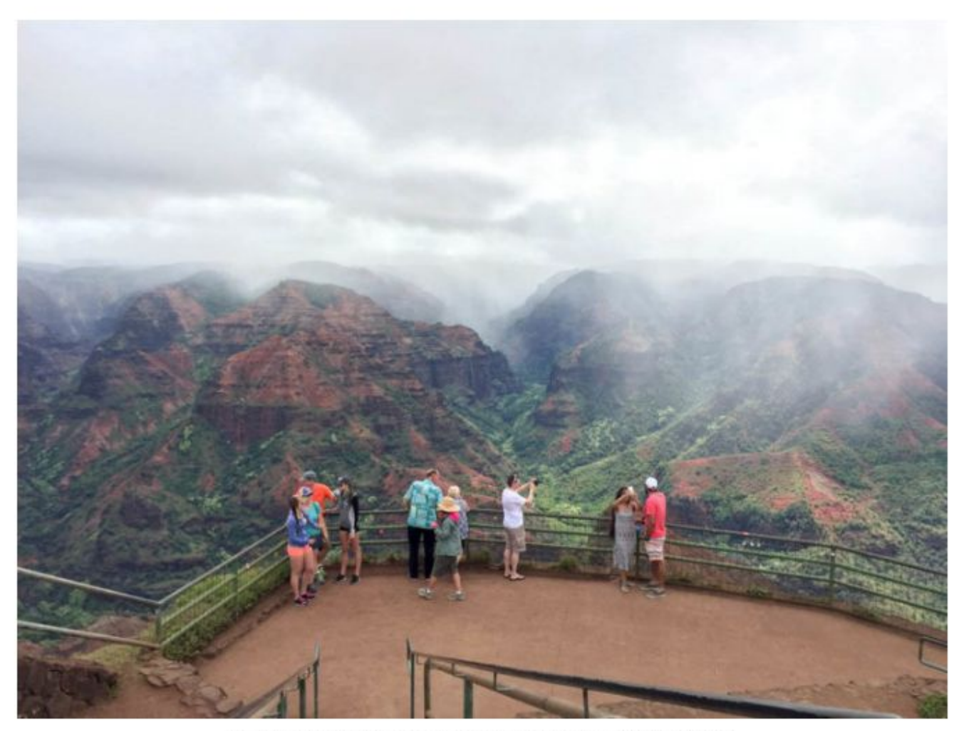
Hiking Waimea Canyon in Kauai.

While Hawaii is only a single state, its eight different islands make it a destination that invites repeated trips. The state boasts not only some of the best beaches in the world, but also some of the most incredible outdoor adventures. You can hike lava fields and tropical canyons, learn to surf, swim with sea turtles and so much more. When you're bringing kids along to the Aloha State, you should pick the best island for your family. Active TravelingMom, Kimberly Tate breaks down all you need to know about choosing the island that's best for your family.