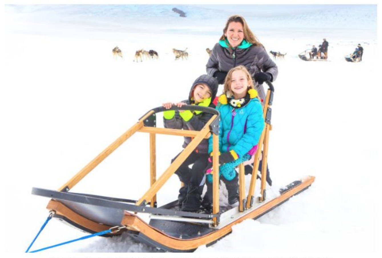
Even kids can have a turn driving the dog sled team.

Springtime in Alaska is a great time to visit cities like Anchorage and the surrounding wilderness. The most exciting outdoor family adventure during this time of year is dog sledding. Our Preschooler TravelingMom, Britni Vigil says, "A fantastic option for kids and adults alike, glacier dog sledding tours take you into the heart of what makes Alaska such a popular destination." If your spring break is in mid March, you might be able to catch the end of the famous Iditarod dogsled race.