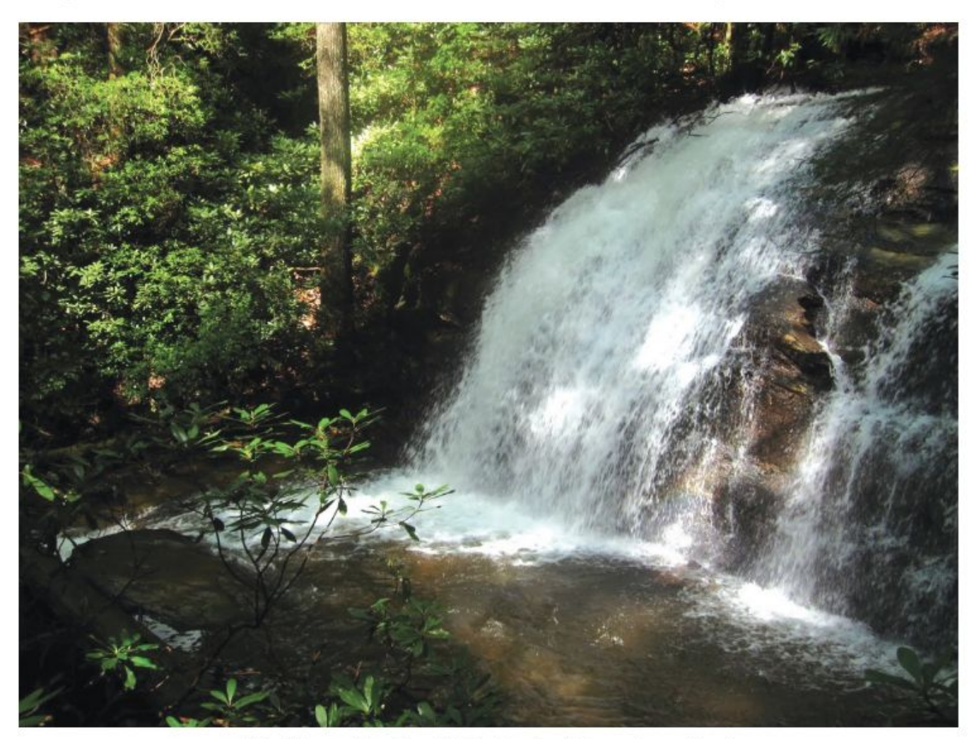
Hiking's free and Long Creek Falls is stunning.

Georgia – Discover Nature And Chase Waterfalls In Blue Ridge