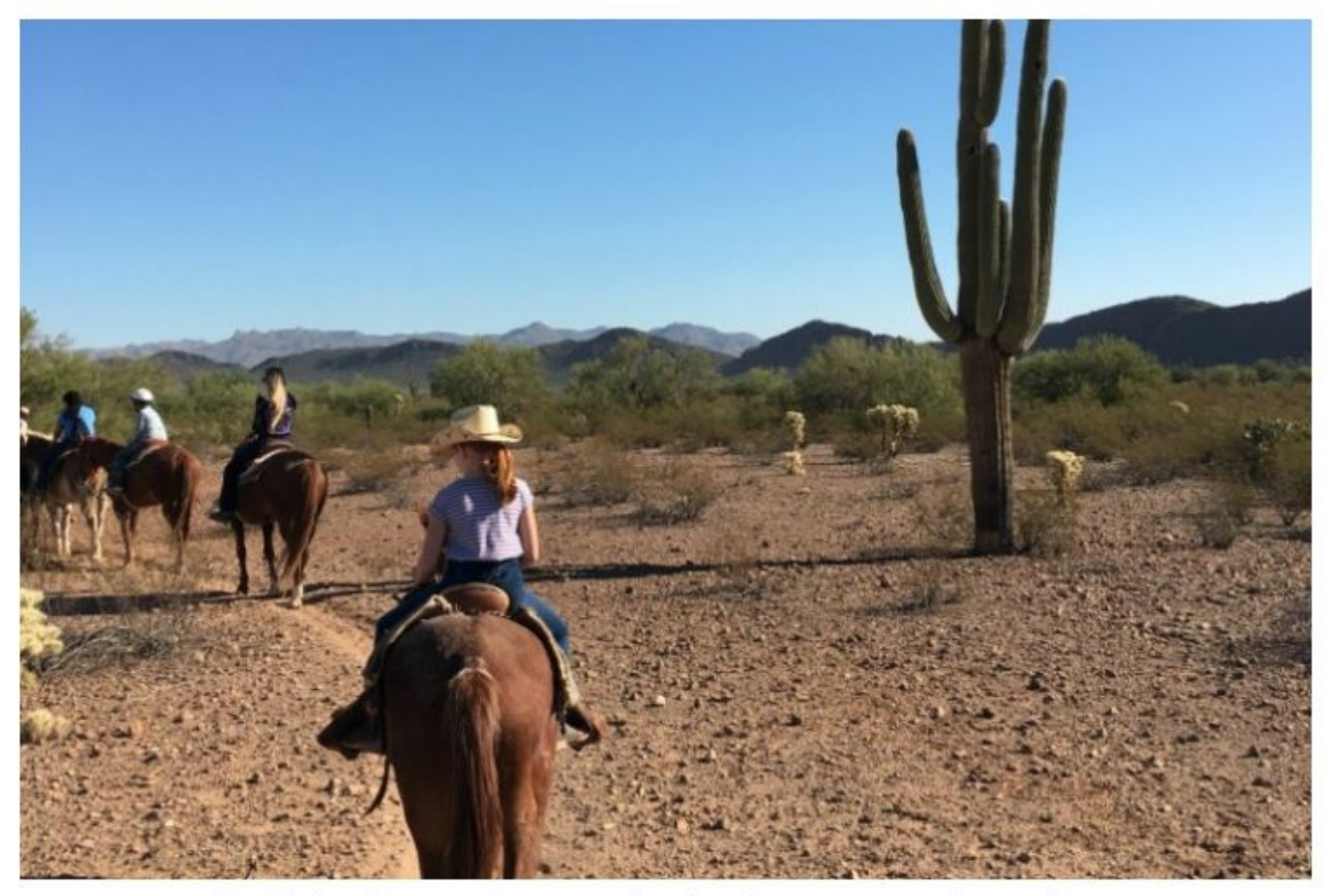
A Slow Ride through Tucson Arizona Desert.

Have you ever considered a dude ranch for your family? This is one on my bucket list for sure! Our Frequent Flyer TravelingMom took her family to the White Stallion Ranch in Tuscon, Arizona. She shares why "your kids may be ready for a dude ranch family vacation sooner than you think." Doesn't her 8-year-old daughter looks right at home on this trail ride?