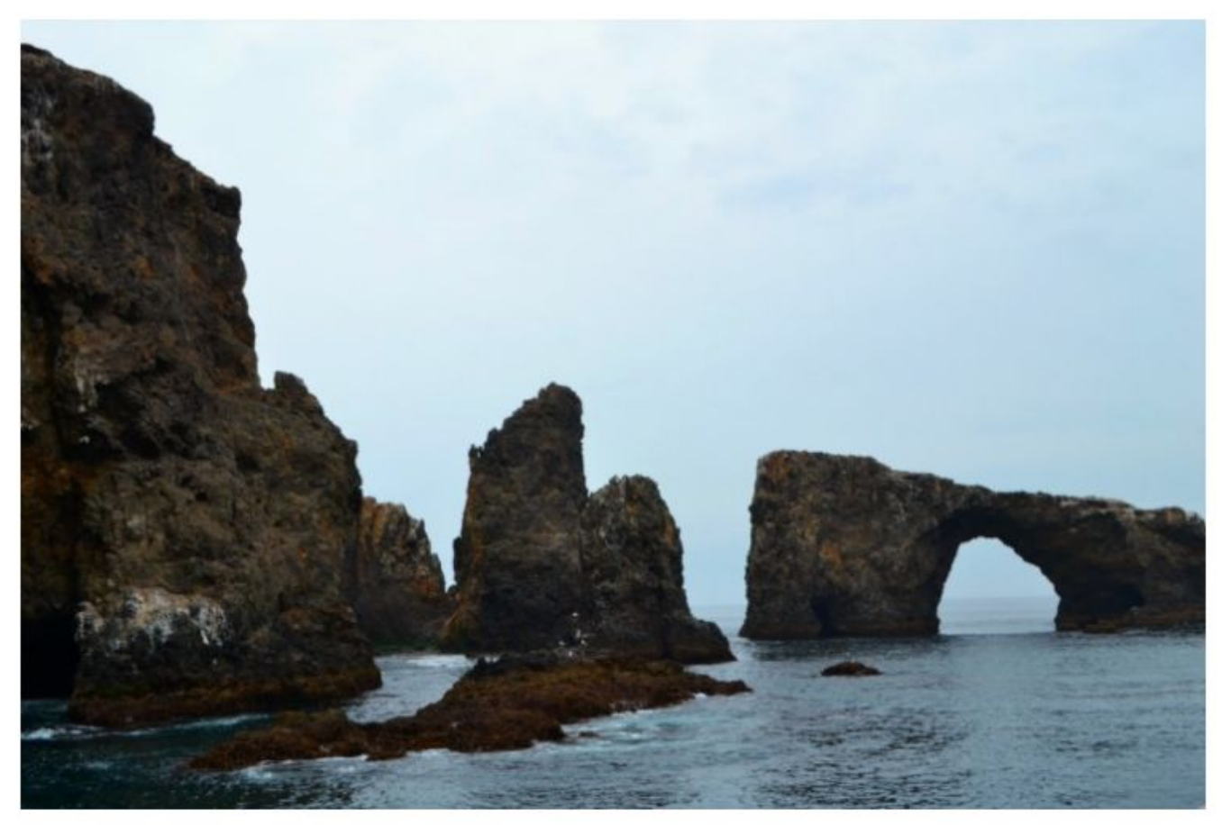
Hiking and kayaking through Channel Islands National park is a must!

Our Globetrotting Grandmom, Terry Marshall explored this particularly beautiful part of California. She shared with us 5 of the best things to do along the <u>Central Coast of California</u>. Channel Island National park is perfect for adventurous families. Here, you can get up close with nature by hiking, kayaking, and snorkeling. Another must-see in the area is Pismo Preserve. It's the newest hiking, biking and equestrian trail system in the area with sweeping views of the Central California Coast.