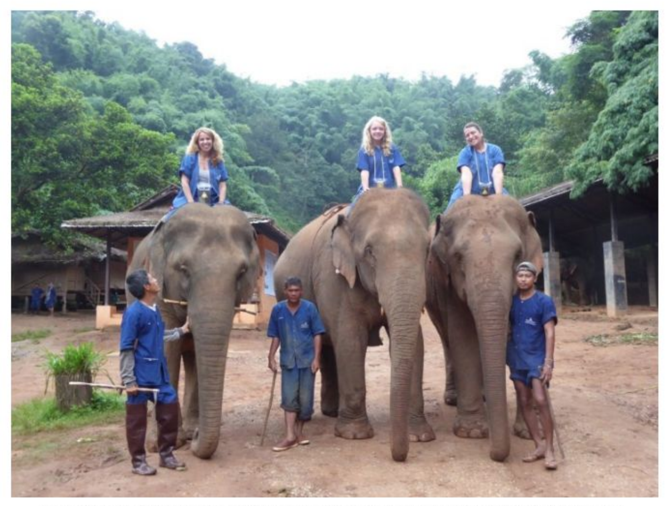
Riding elephants at the Anantara Golden Triangle Elephant Camp and Resort in Chiang Rai, Thailand.

Thailand - Hiking To Temples, Riding Elephants And Chatting With Monks