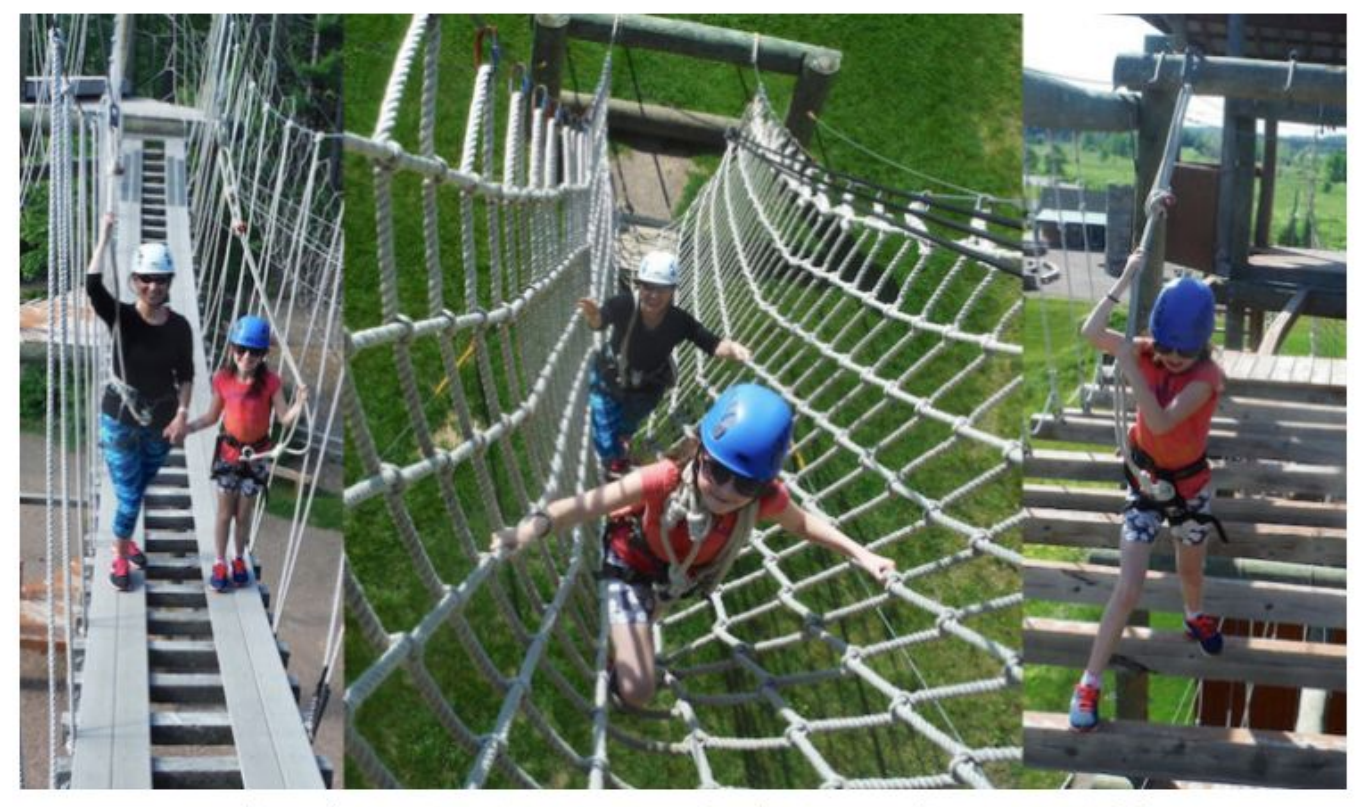
Taking on the Ropes Course in Essex, Vermont.

During spring break, you might still catch some good skiing in northern Vermont, but even if there is no snow, there is plenty to do in the Green Mountain State. If you are looking for a luxurious place to stay, you can't beat the Stoweflake Resort. Its large indoor pool is always good for a swimming workout. Open in all weather conditions, the Norther Lights, Rock and Ice in Essex, Vermont offers ropes courses, a giant swing, and a 450 foot zip line. Spring is also a great time to get muddy with some mountain biking in southern Vermont.