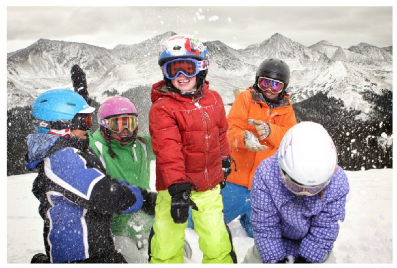
Kid-friendly Copper Mountain Ski Resort welcomes you to the breathtaking Colorado Rockies.

Colorado – Spring Skiing, Tubing And Even A Mountain Coaster