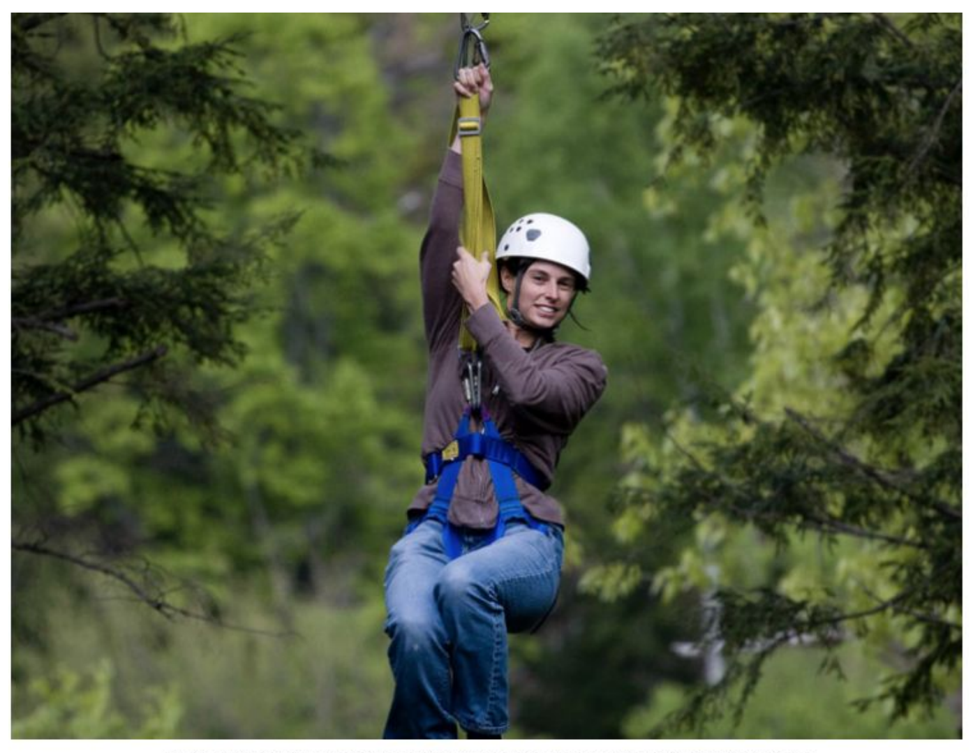
Zip-lining in the White Mountains of New Hampshire.

New Hampshire – Ziplining, Off Roading And Hiking In The White Mountains