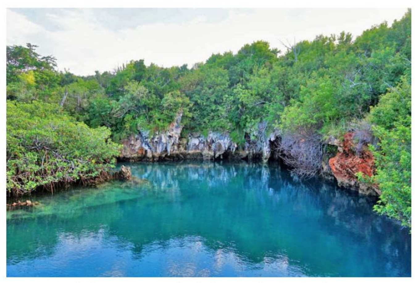
Walsingham Nature Reserve, Bermuda - photo by Yvonne Jasinski Credit Card TravelingMom

Bermuda is a unique family destination with pink-sand beaches and a blend of British and American culture. Home to over 300 shipwrecks and a network of caves, it's a perfect location for an active spring break vacation. Vehicles are not allowed on this small island (just 21 square miles). Bermudians ride motorbikes to get around, but Los Angeles TravelingMom recommends hiring private tour guides. Peak season is April-October so if your spring break is in March, you can beat the crowds.